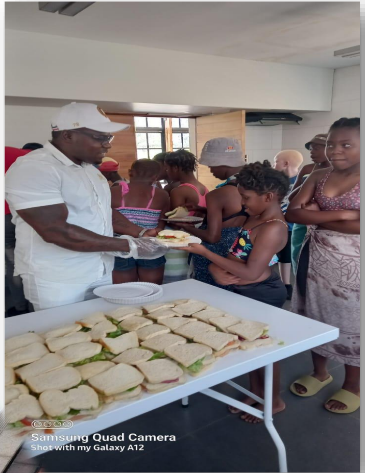
Samsung Quad Camera Shot with my Galaxy A12