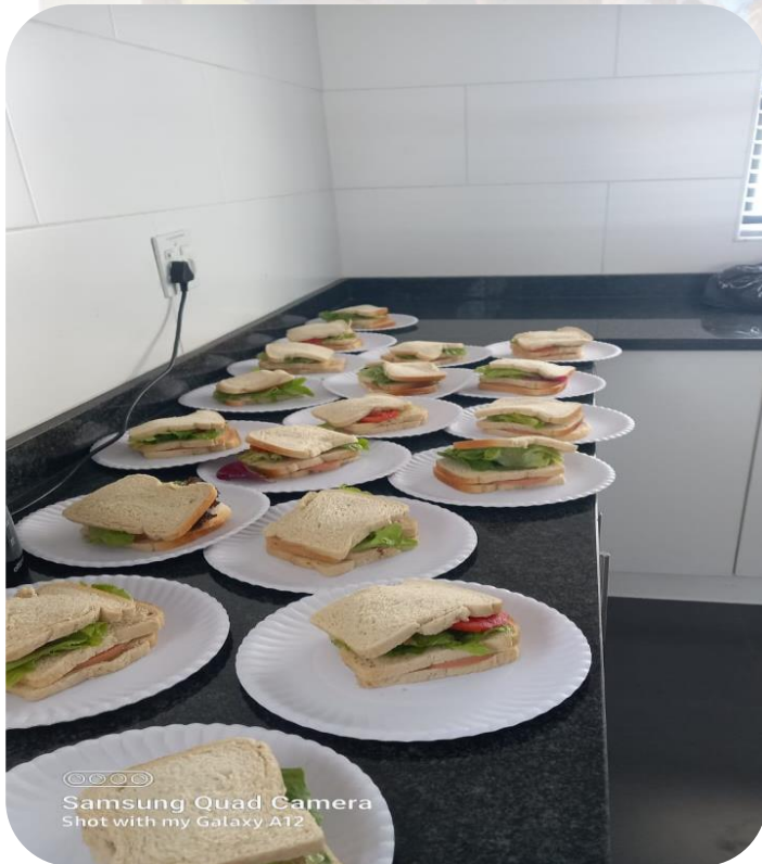
Samsung Quad Camera Shot with my Galaxy A12