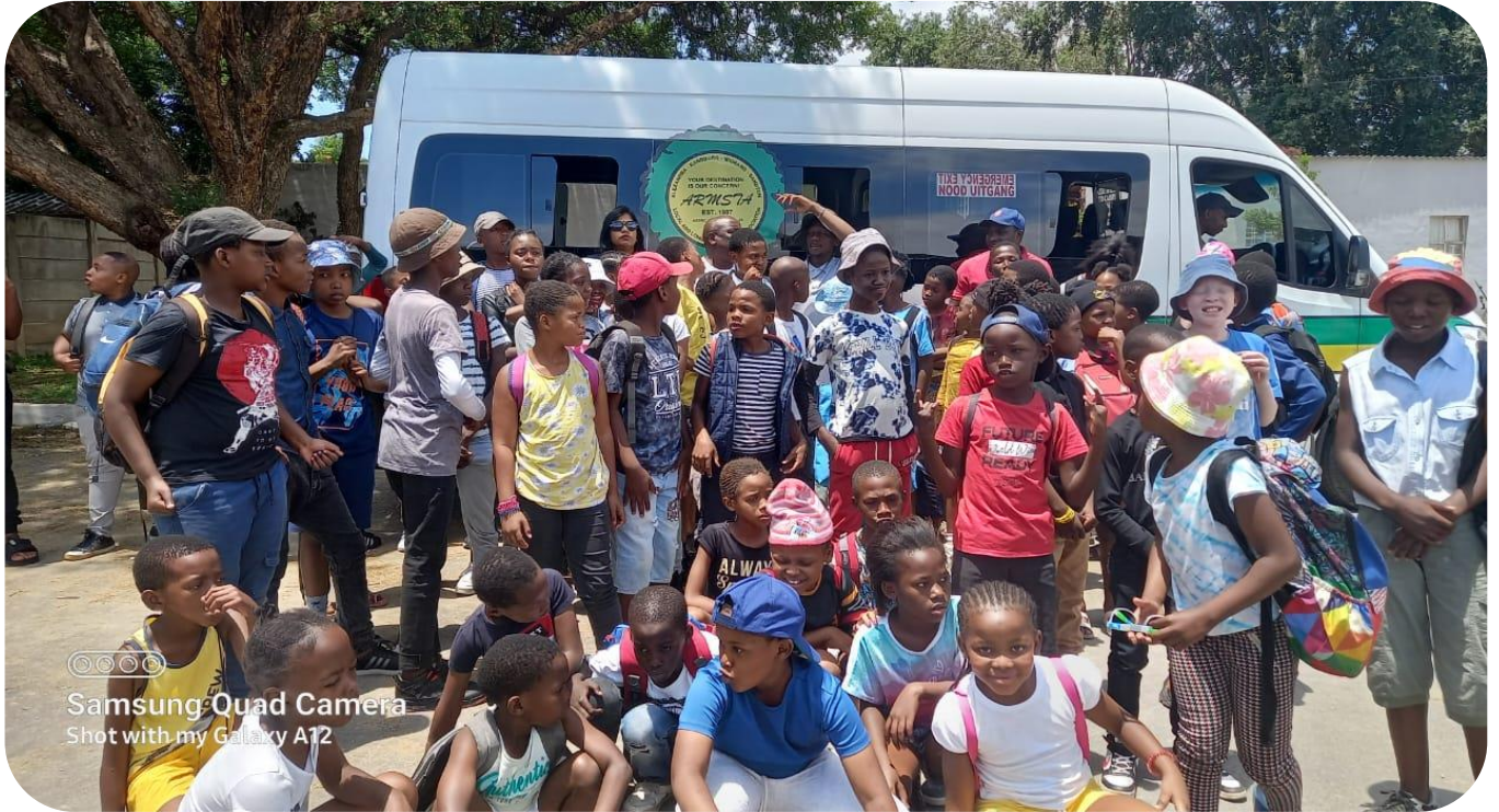
Samsung Quad Camera Shot with my Galaxy A12

166 – 15TH Ave Alexandra Johannesburg 2090 Reg: 2019/532417/08